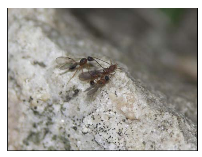
Fig. 1: Two males of Pyramica argiola , courting a gyne. Mating only happens on the ground near the area of the courtship display.

The distribution area of P. argiola is centred around the Mediterranean basin (BERNARD 1968), which implies that