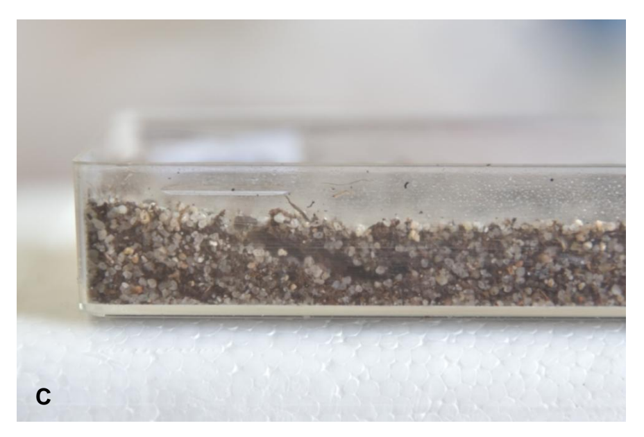
Fig. S3: Colonies of the acorn ant Temnothorax crassispinus are able to dig a cavity in the soil. During the laboratory experiment, the ant colonies were transferred to Petri dishes contained mix 1:1 of dry sand and wet soil, light tamped down, thickness of the layer about 10 mm. There were no nest cavities in the Petri dishes, but small, flat stones were putted on the surface of the layer.